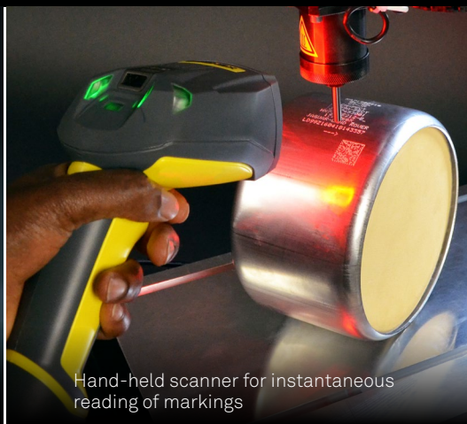
Hand-held scanner for instantaneous reading of markings