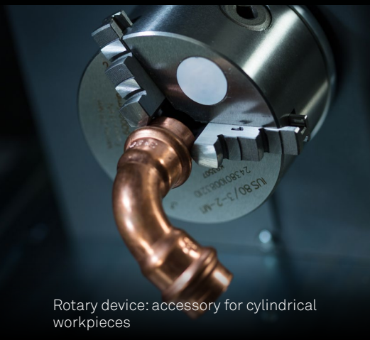
Rotary device: accessory for cylindrical workpieces